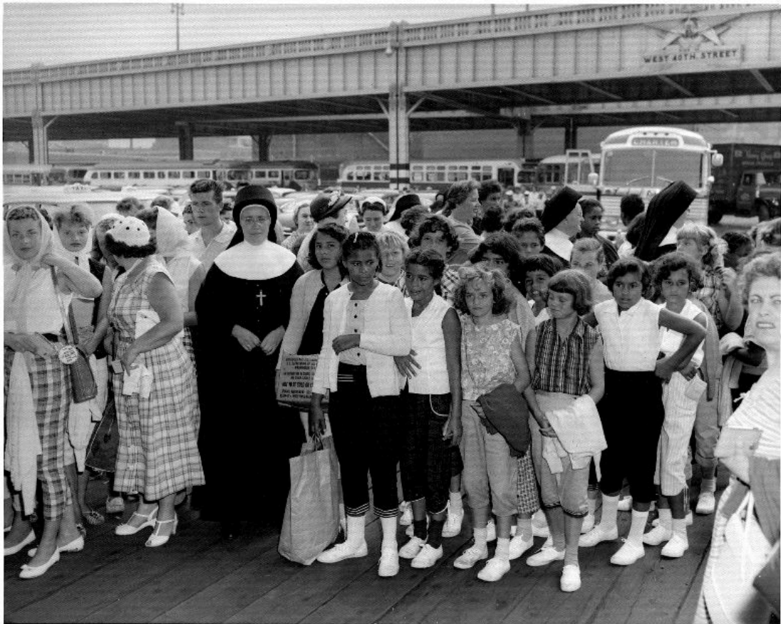
Little Flower Takes Manhattan! We're sending an intergenerational thank-you to these nuns who took our Little Flower youth of yesteryear on a fun field trip to the City.